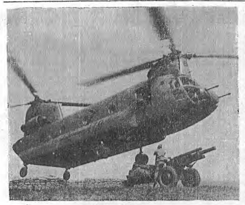
THE LIFTER ...

A "Chinook" helicopter hovers over a 4th Division howitzer which will be airlifted into a combat zone. This is just one of many roles for the helicopter.