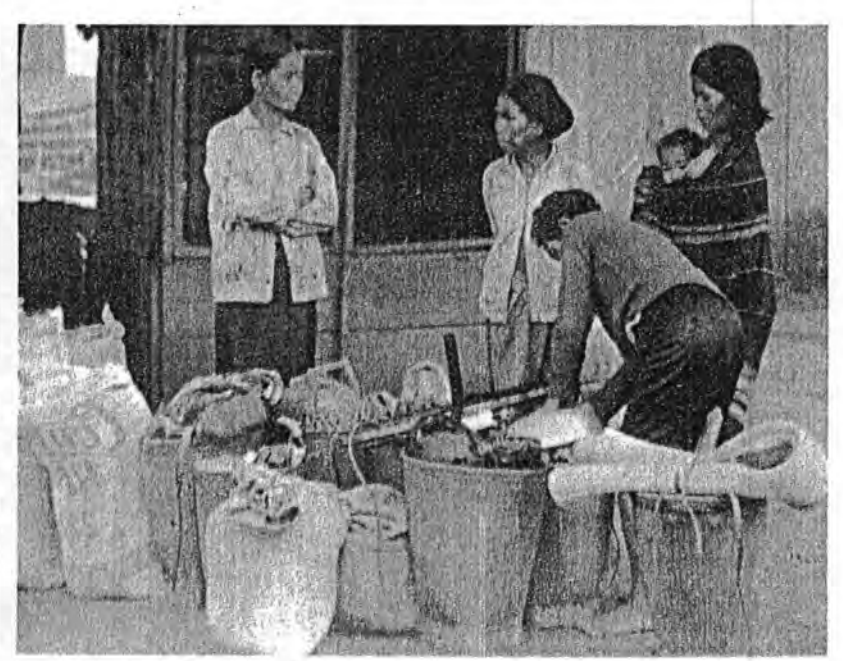
THESE VILLAGERS AWAIT TRANSPORTATION BACK TO THEIR HOMES.