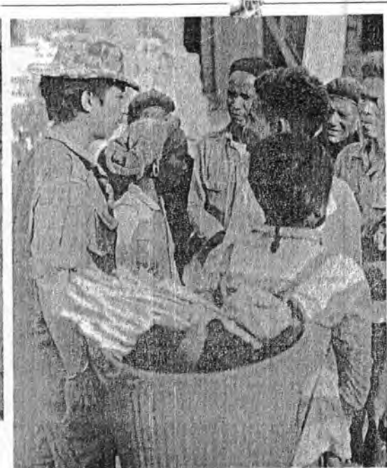
RECEIVING INSTRUCTIONS BEFORE THE TRIP TO PLEIKU.