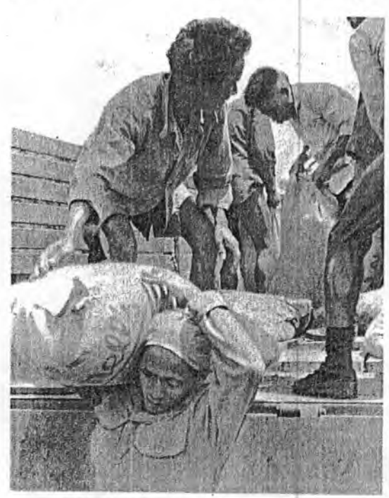
UNLOADING THE RICE BOUGHT IN PLEIKU.