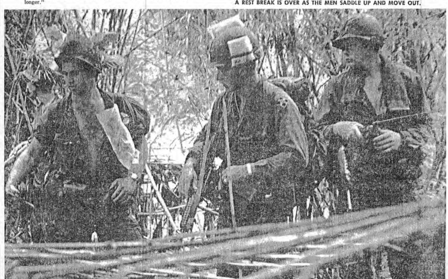
MEN FROM COMPANY A, 1ST BATTALION, 22ND INFANTRY, SURVEY A CRUDE ENEMY HOOCH FOUND IN THE IA DRANG VALLEY.