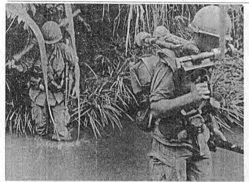
WET JOURNEY—Mortarmen from Company C, 1st Battalion, 12th Infantry cross a monsoon-swollen stream while carrying their 81mm tubes during Operation Francis Marion in the Central High