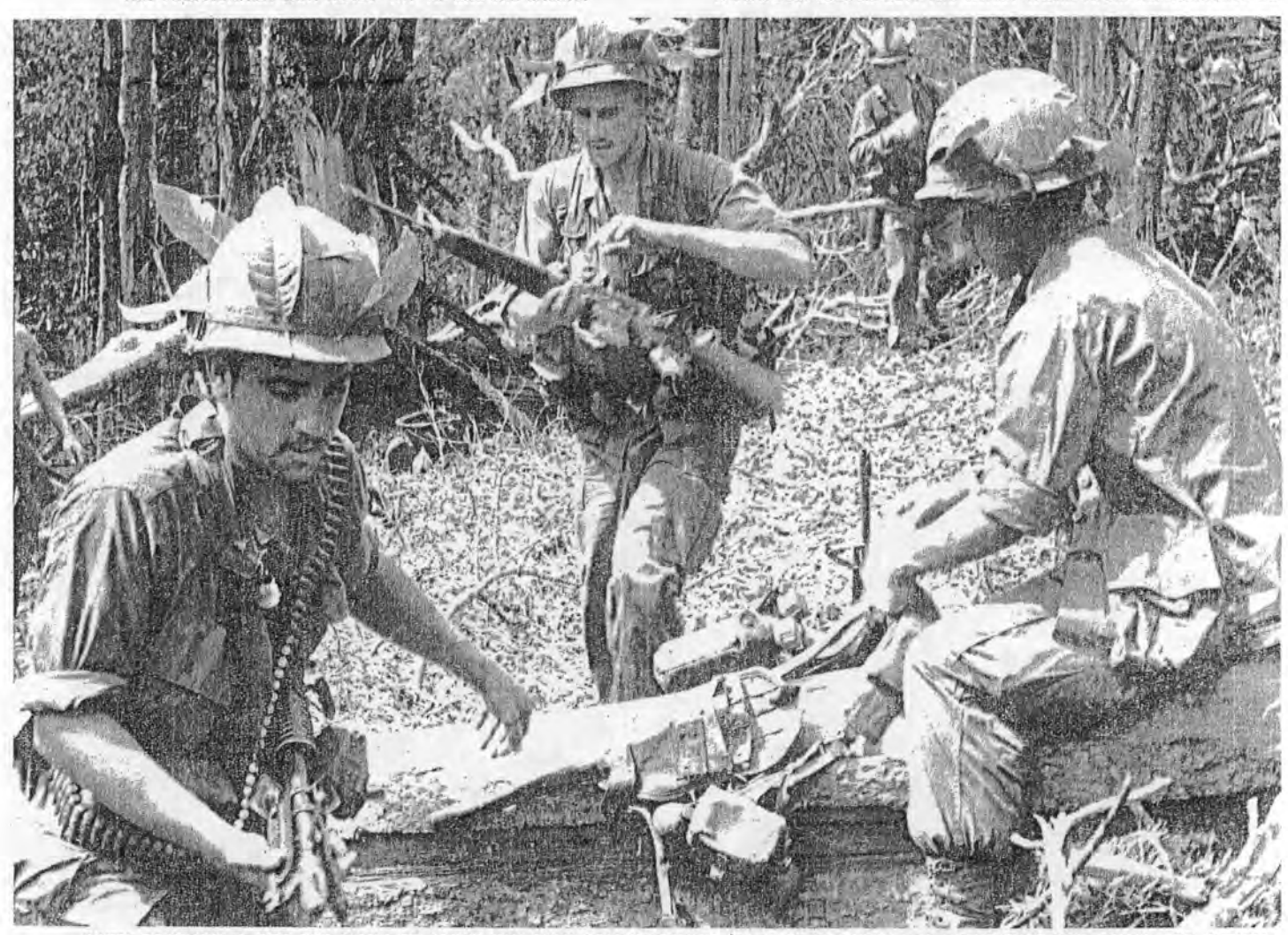
WHEN COMPANY A GOT THE WORD TO MOVE OUT THEY REALLY HUSTLED AS THEY SPARCHED FOR THE ENEMY AND HOPED FOR ACTION.