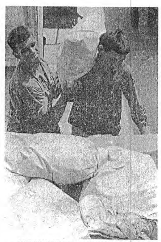
AN IVYMAN HELPS A VIETNAMESE LOAD CEMENT.