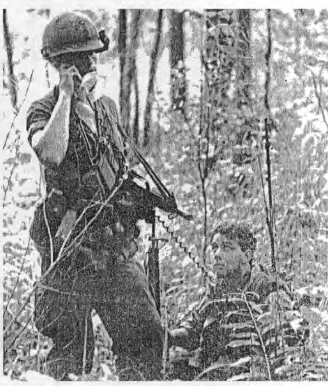
PLATOON LEADER GETS THE LATEST WORD FROM HIS COMPANY CO