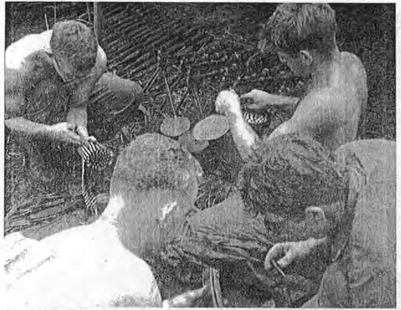
COUNTING THE SPOILS—"Dragoons" of the 3rd Battalion, 8th Infantry tally the vast amount of weapons and ammunition taken by the battalion after a recent fight with a large NVA force on a hill later named "The Dragoon's Den."