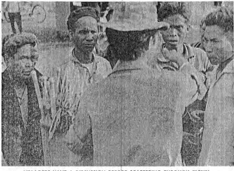
VILLAGERS HAVE A DISCUSSION BEFORE SCATTERING THROUGH PLEIKU.