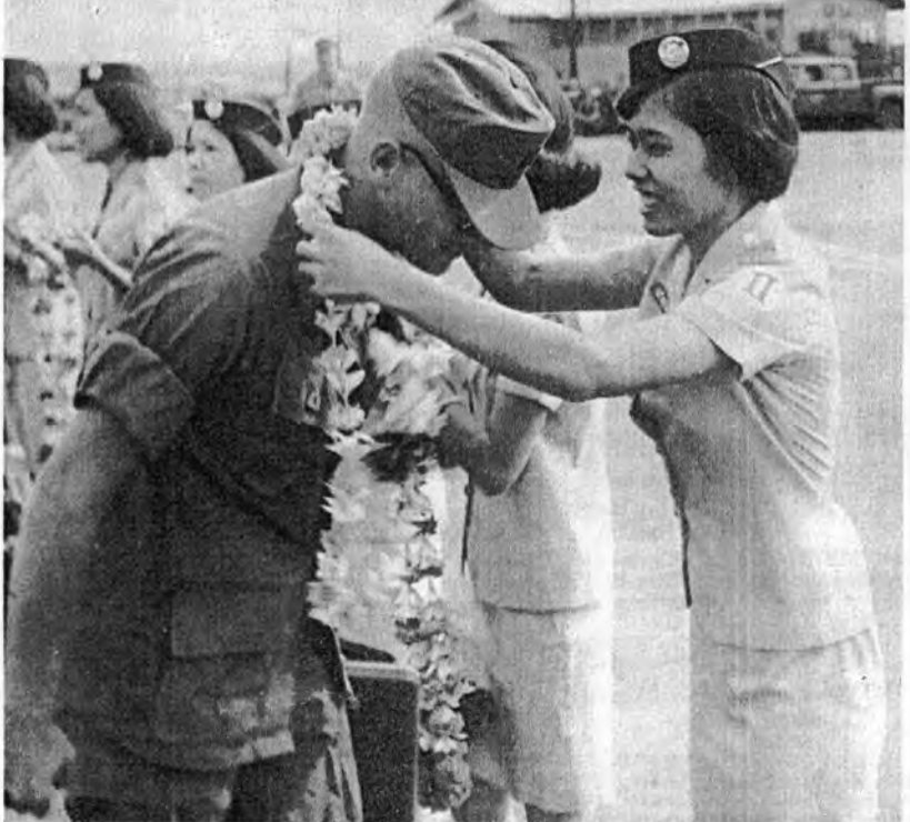
BON VOYAGE - The first five lyymen from the 3rd Brigade received flowered leis from Vietnamese Air Force Women