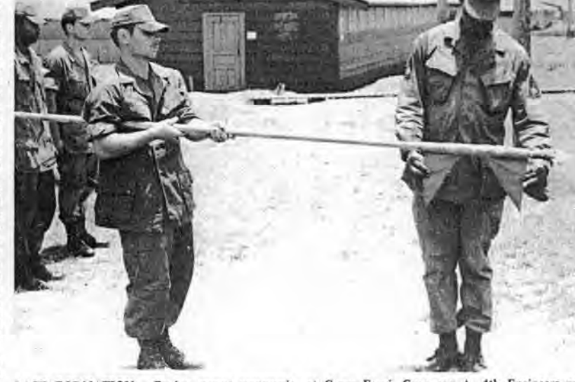
AST FORMATION - During recent ceremonies at Camp Enari, Company A, 4th Engineers was deactivated as the colors were retired.

The last meal of the day is served and the sun becomes a red glow in the western sky. Night quickly descends upon their activities as the provisions are laid out for the next morning. At the end of the day each man is alone with his own thoughts, thinking of the next day and beyond.