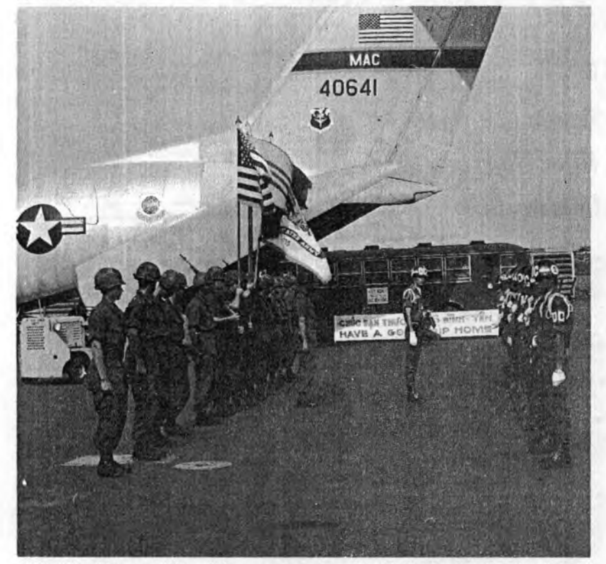
TAIL END - Vietnamese Military Policemen and members of the 4th Division Color Guard await the file of departing Ivymen.