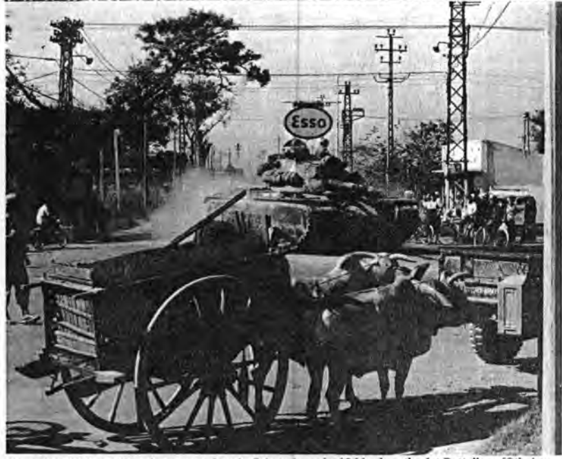
HISTORY BOOK - This photo was taken in Saigon in early 1966 when the 1st Battalion, 69th Armor arrived. The "Black Panthers" have now redeployed as part of the 4th Division's 3rd Brigade.