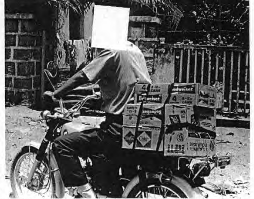
BAD BUSINESS - Don't sell cases of soft drinks or beer on the Black Market. It will get you in deep trouble and this practice inflates the Vietnamese economy. Be smart.

over from there, serving the veteran's interest