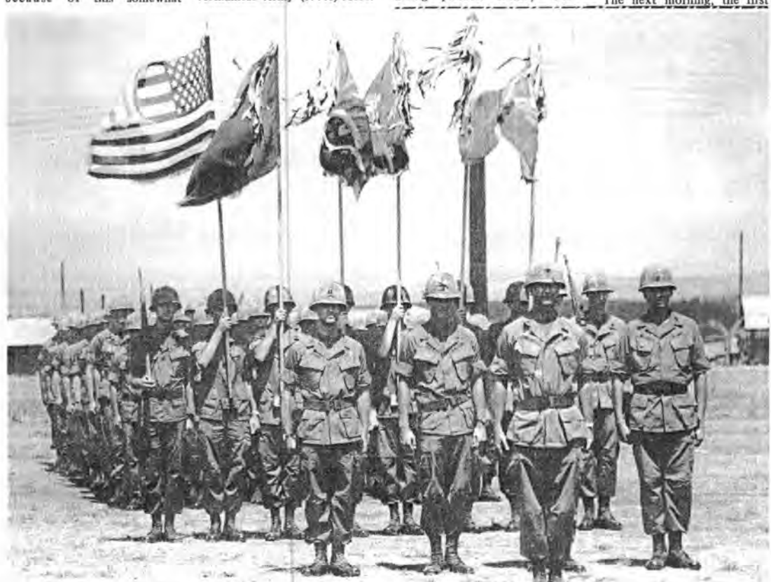
STANDING TALL - With Flags flowing, members of the 3rd Brigade stand at attention under the command of Colonel Gilbert Procter during farewell ceremonies at Camp Enari

The Regulars also found a 50-pound box of solid white lubrication which according to a Company D Kit Carson Scout, is used for a lubricant and a protective coating for weapons when they are buried.