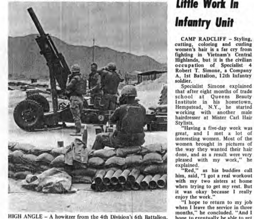
HIGH ANGLE - A howitzer from the 4th Division's 6th Battalion, 29th Artillery, throws out fire support from IZ Hard Times.

Melt oil or fat, add flour and stir just like making a gravy base. Mix cream packs and water, add to mixture and continue to cook until sauce begins to thicken. Add cheese spread and cook until cheese melts. Empty cans of turkey loaf and chicken noodles into cooking. Cover Big Al's dinner with crumbled crackers and serve piping hot in your nearest bunker. * These items are in you basic C-rations.