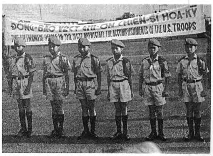
YOUTHFUL TRIBUTE - Cadets from Highland Junior Military Academy stand at attention at the 3rd Brigade farewell ceremony at Pleiku Air Force base.