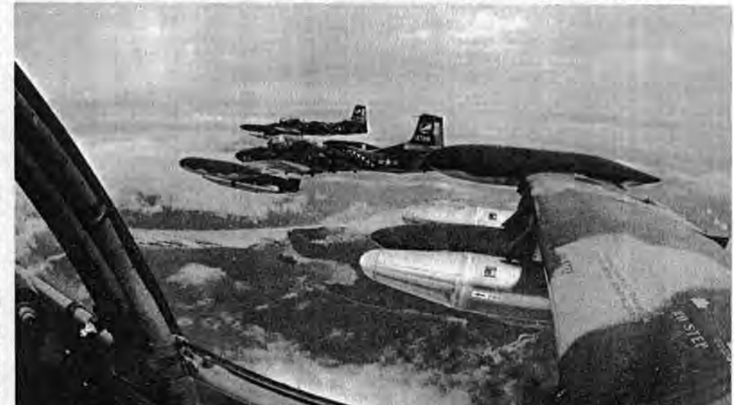
A flight of A-37s from Nha Trang heads for a communist target near Qui Nhon on the central coast. Vietnamese pilots from Nha Trang range deep inland to the Central Highlands, destroying enemy targets that artillery cannot reach.

Within three months after the wing became operational the enemy in the Delta was all too familiar with the sound of Choctaws and Skyraiders as they gave close support to ARVN and U.S. infantry operations. In June 1966, when the 74th's pilots supported the 21st ARVN Division in battle of Dan Chi, the wing